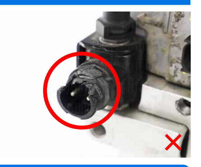
Missing / illegible label