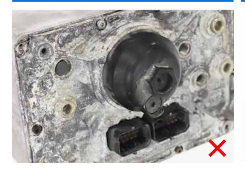
Disassembled / incomplete part