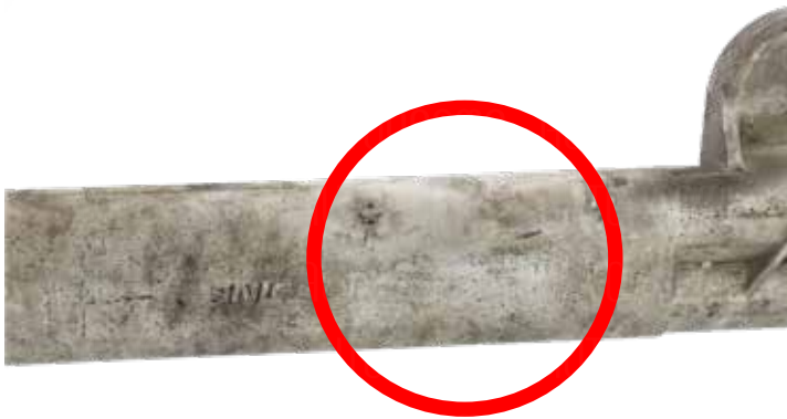
Missing / illegible label